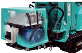
Detachable Electric Motor (Option)