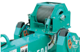
Auxiliary Winch (Option)