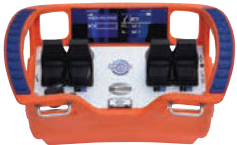
Paddle Lever Wireless Remote Control

MULTIPLE POWER OPTIONS DIESEL / ELECTRIC