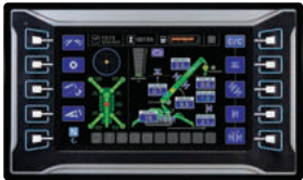
Programmable Moment Limiter