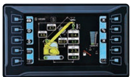
Programmable Moment Limiter