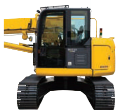
Minimal Tail Swing