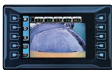
Rear View Monitor