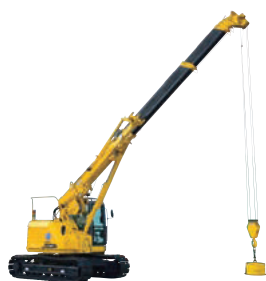
Pick & Carry Duty 4,400lb